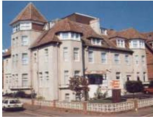
Tower House Hotel West Cliff Gardens Bournemouth BH2 5HP

Tower House Hotel is about 100 metres from Bournemouth west cliff and the zig zag path to the beach. It is a family run hotel and you will receive a warm welcome along with good food. The hotel has en-suite bathrooms / shower rooms, and has a lift, but there are a few steps to the front doors.